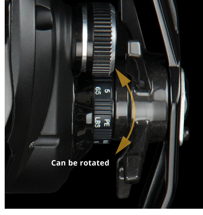
C-40X carbonite star drag